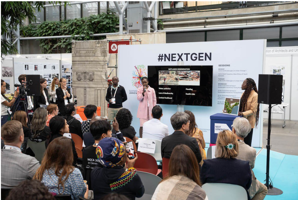
Figure 2: Next Gen UIA World Congress of Architects 2023